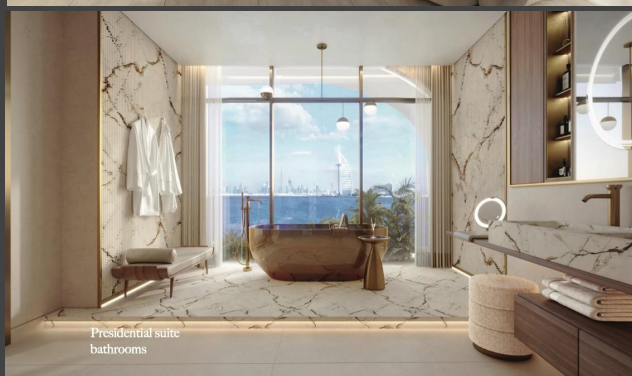
Presidential suite bathrooms