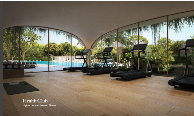
Health Club Higher perspectives on fitness