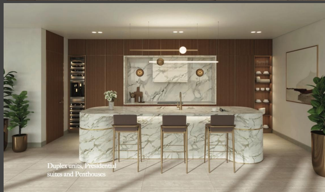
Duplex units, Presidential suites and Penthouses