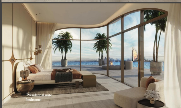
Presidential suite bedrooms