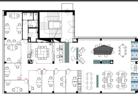
1ST LEVEL FLOOR PLAN