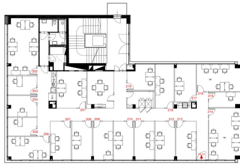
2ND LEVEL FLOOR PLAN